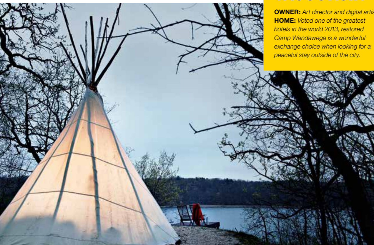
WISCONSIN OWNER: Art director and digital artist HOME: Voted one of the greatest hotels in the world 2013, restored Camp Wandawega is a wonderful exchange choice when looking for a peaceful stay outside of the city.

'WHEN GUESTS COME I ALWAYS MAKE SURE THEY HAVE LISTS AND ADDRESSES OF ALL THE BEST PLACES'